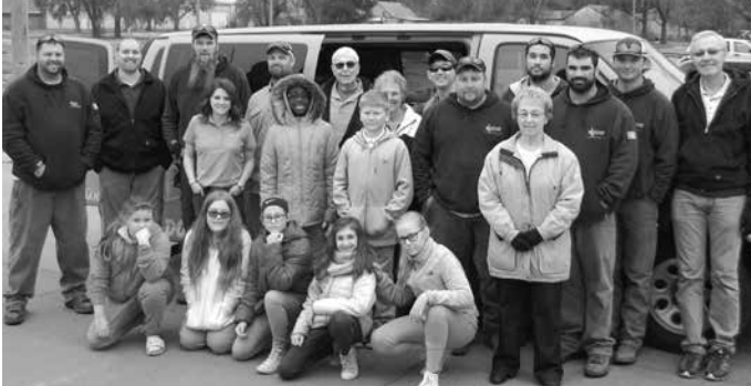
Central Kansas Christian Academy students helped deliver 5,700 pounds of food to the Barton County Food bank. CKCA was the winner of the inaugural Cram the Van School Challenge sponsored by Hiss-Sherman Wealth Management.