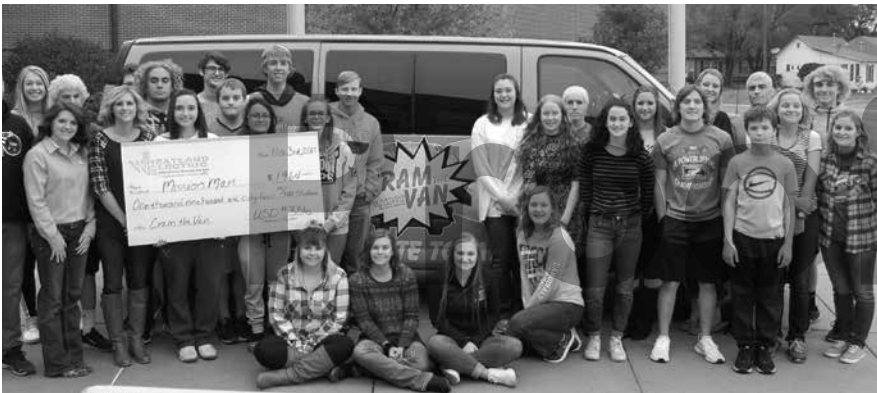
Students from the Conway Springs High School helped to collect more than 4,332 pounds of donations and $1,964 to the local Mission Mart food bank.