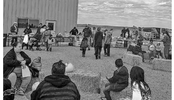
The Cram the Van Fall Finale was held at the Spencer Flight & Education Center, where attendees could participate in a candy drop, Young Eagle airplane rides, pumpkin decorating, hay rides and other fall activities.